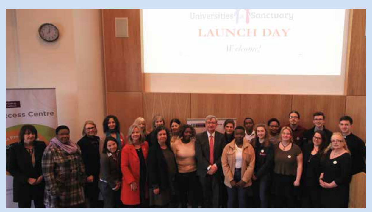
Steering Committee at Campaign Launch.

Since this formal launch, and with the full support of the NUI Galway President, the Steering Committee has embedded the ethos of the Places of Sanctuary across campus with the aspiration of creating an inclusive, inviting and welcoming campus for all people. The overall aim of the NUI Galway campaign is to break down the barriers for individuals regardless of their societal positioning, and offer a genuine 'Welcome to NUI Galway'. The principles set out by the Places of Sanctuary ethos have guided our Steering Committee on how best to proceed with the UoS campaign on campus and, although being a University of Sanctuary will require on-going processes, we feel that at this time we are in a position to be designated an official University of Sanctuary.