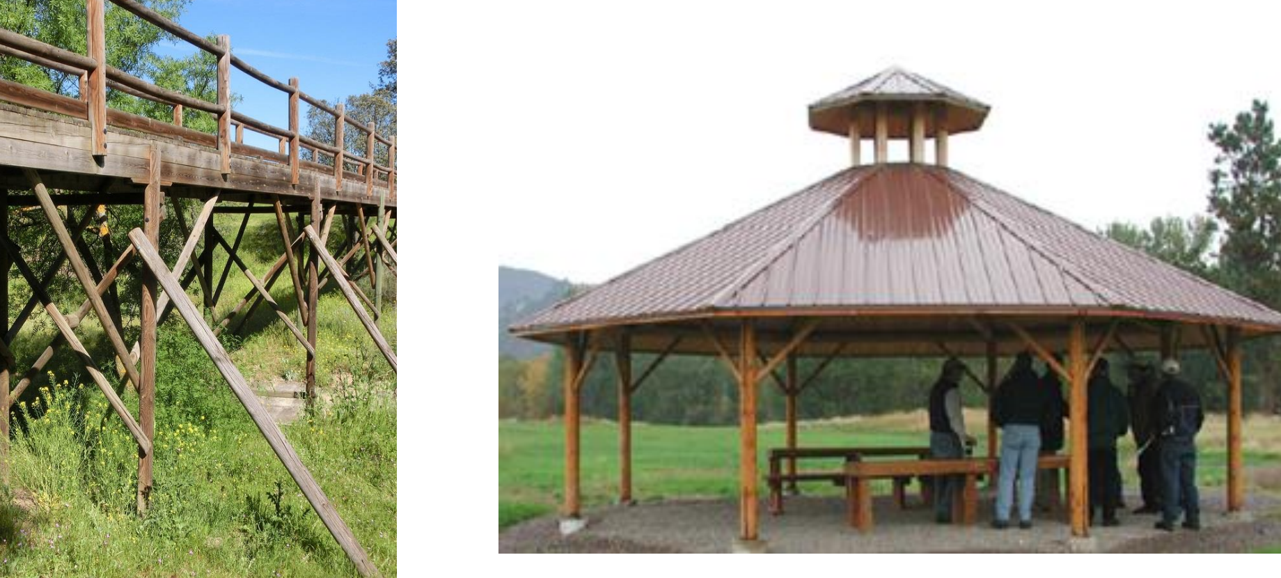
Fig. 4 : End-uses of round timber: playgrounds (a,b), footbridge (c), kiosk (d)